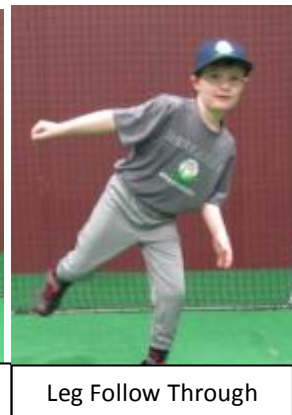
Leg Follow Through