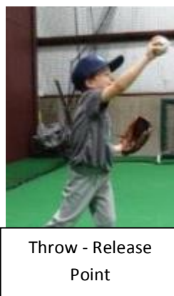
Throw - Release Point