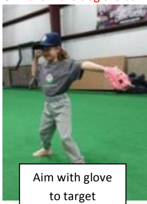
Aim with glove to target