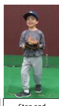
Step and Throw